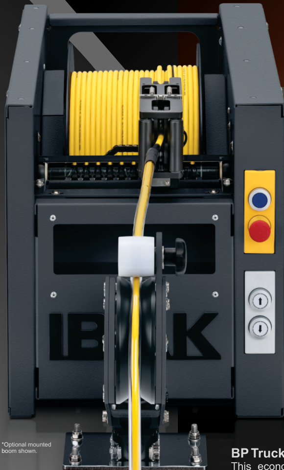
*Optional mounted boom shown.