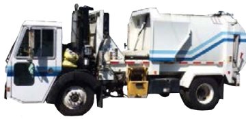
1996 CCC w/ 2005 Labrie Minimax

Used 12 Yard Side loader equipped with a 3116 CAT engine, Allison transmission, Dual Perkins carippers and more. #140066