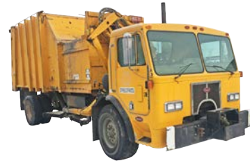
1988 Peterbilt 320 w/ Heil Formula 7000

Used 20Yard Automated Side Loader equipped with a Cummins L10 engine, Allison MT654 transmission, 41,200 GVWR and more. #160130