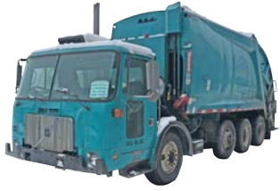
2000 Volvo w/ McNeilus WXLL64

Used 25 Yard Rear loader equipped with Cummins 280HP engine, Automatic transmission, 73,020 GVWR and more. #160064