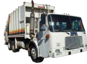
1988 Volvo w/ Leach 2Rll

Used 25 Yard Rear loader equipped with a Detroit engine, Allison transmission, Drum winch, Container dump bar, Full eject and more. #6578