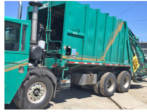
2002 CCC w/ Leach 2Rll

Used 25 Yard Rear loader equipped with a a CAT engine, Automatic transmission, 65k GVWR, 16k hours and more. #170100