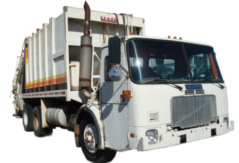
1988 Volvo w/ Leach 2Rll

Used 25 Yard Rear loader equipped with a Detroit engine, Allison transmission, Drum winch, Container dump bar, Full eject and more. #6578