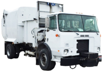
2001 Volvo w/ Wayne Curbtender

Used 20 Yard Side loader equipped with a Allison transmission, 44,740 GVWR, 107k miles, 3k hours and more. #160004