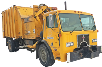
1988 Peterbilt 320 w/ Heil Formula 7000

Used 20 Yard Automated Side loader equipped with a Cummins L10 engine, Allison MT654 transmission, 41,200 GVWR and more. #160130