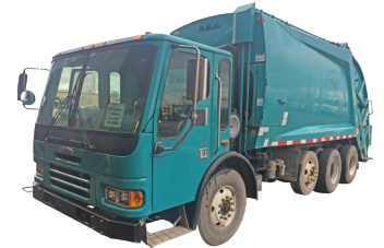
2001 Freightliner w/ McNeilus

Used 25 Yard Rear loader equipped with a Cummins ISL engine, Automatic transmission, 75,020 GVWR and more. #160065