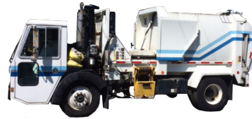
1996 CCC w/ 2005 Labrie Minimax

Used 12 Yard Side loader equipped with a 3116 CAT engine, Allison transmission, Dual Perkins car tippers and more. #140066