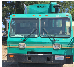
2000 CCC w/ McNeilus

Used 25 Yard Rear loader equipped with a a CAT engine, Automatic transmission, 65k GVWR, 21k hours and more. #170097