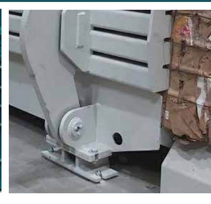
Raiser kit allows for easy cleaning and clearing around baler.