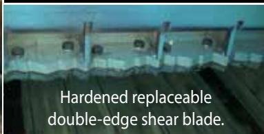
Hardened replaceable double-edge shear blade.