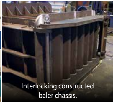
Interlocking constructed baler chassis.