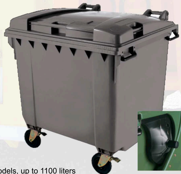
All models, up to 1100 liters