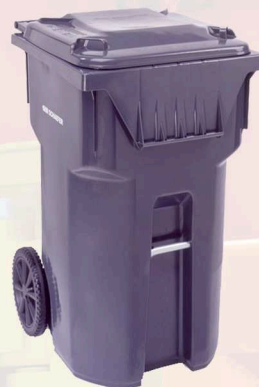
D6207 & 08 only