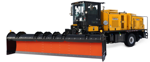
FP18 | FP20 | FP22