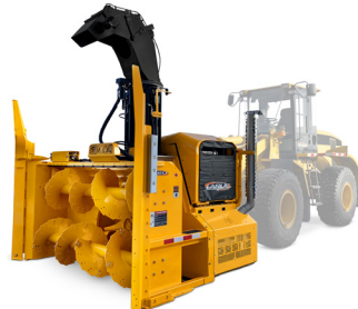
D30 | D40 | D50 | D60