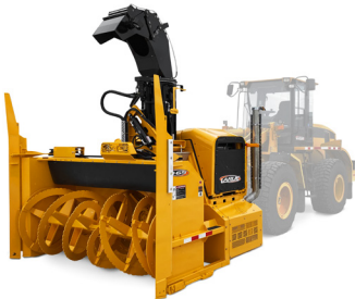
D25 | D35 | D45 | D55 | D65