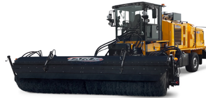
FB18 | FB20 | FB22